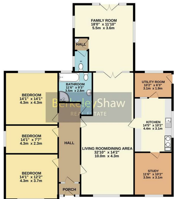
TOTAL FLOOR AREA: 1759 sq.ft. (163.4 sq.m.) approx. Whilst every attempt has been made to ensure the accuracy of the floorplan contained here, measurements of doors, windows, rooms and any other items are approximate and no responsibility is taken for any error, omission or mis-statement. This plan is for illustrative purposes only and should be used as such by any prospective purchaser. The services, systems and appliances shown have not been tested and no guarantee as to their operability or efficiency can be given. Made with Mensapix C2024