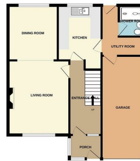
GROUND FLOOR 691 sq.ft. (64.2 sq.m.) approx.