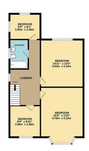
of doors, windows, rooms and any other sems are approximate and no responsibility is staten for any ememission or me-statement. This plans is for Busharier purposes only and should be used as such by an prospective purchaser. The services, systems and appliances shown have not been tested and no guarar as to their operating or efficiency can be given.